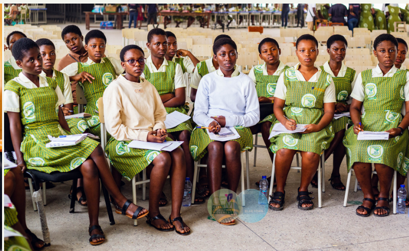
Focus Group Session on Online Safety