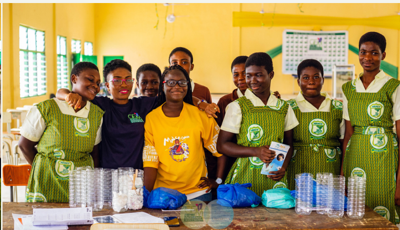
STEM Experiment on Density