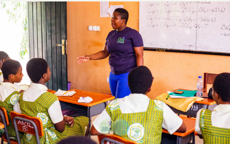
Focus Group Session on Emotional Intelligence