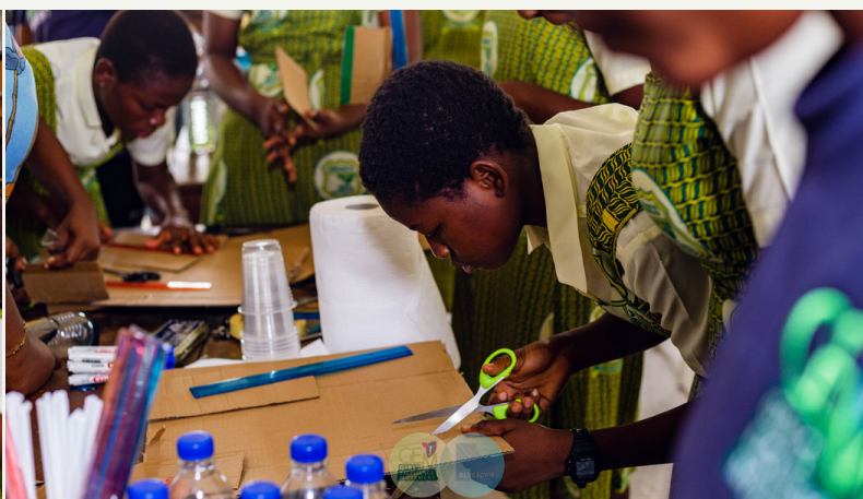
STEM (Water Dispenser) Challenge