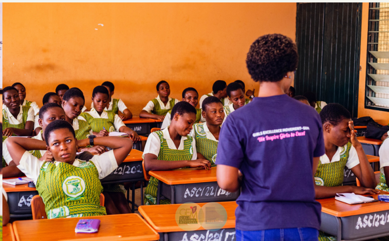
Focus Group Session on Online Safety