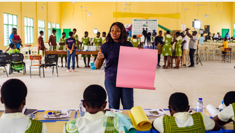
Focus Group Session on Vision Board Creation