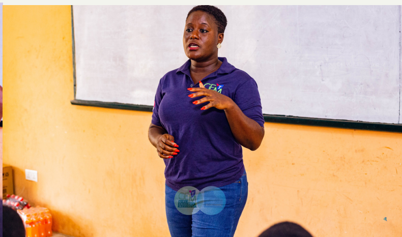
Focus Group Session on Financial Literacy