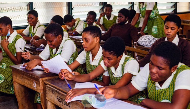
Focus Group Session on Sexual CONSENT