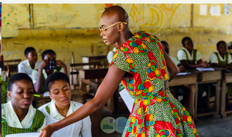
Focus Group Session on Confidence