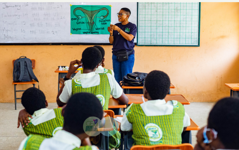
Focus Group Session on Menstrual Hygiene Education