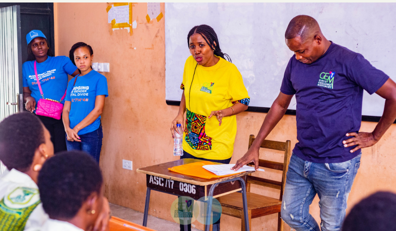
Focus Group Session on Career Choices